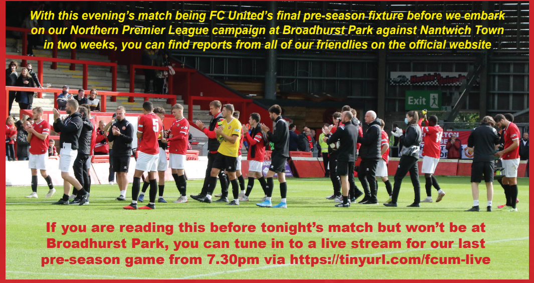
With this evening’s match being FC United’s final pre-season fixture before we embark on our Northern Premier League campaign at Broadhurst Park against Nantwich Town in two weeks, you can find reports from all of our friendlies on the official website

If you are reading this before tonight’s match but won’t be at Broadhurst Park, you can tune in to a live stream for our last pre-season game from 7.30pm via https://tinyurl.com/fcum-live