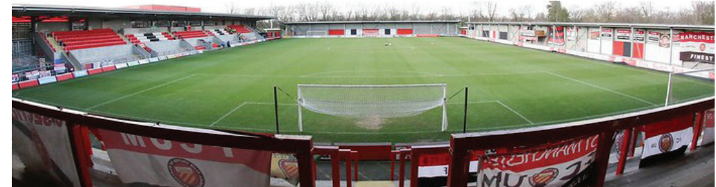
A full list of fixtures, including scheduled FA Cup and Trophy dates, can be found on the official site

MAY 1 Witton Albion (A) 3 Radcliffe (H) 8 Grantham Town (A)